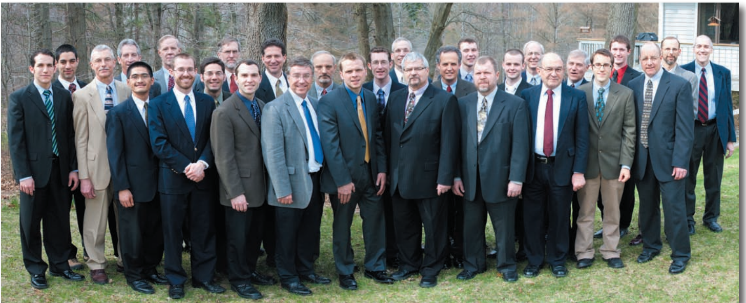
Our North American brothers at our 2011 Easter celebration.