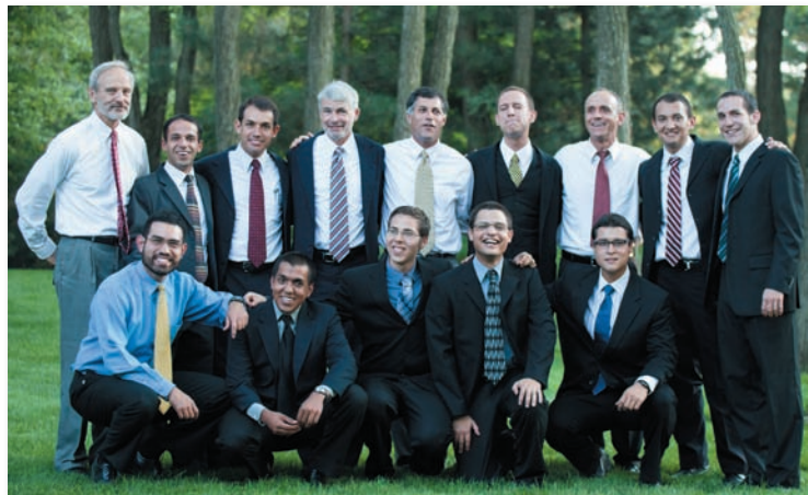
An international grouping of brothers at our recent commitment ceremony at Chelsea, Michigan.

Please keep our brothers in your prayers as they adjust to their new roles and reestablish relationships with those serving alongside them in their new assignments. ▲