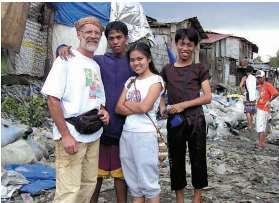
Q with friends at a squatter area beside the dump in Payatas.