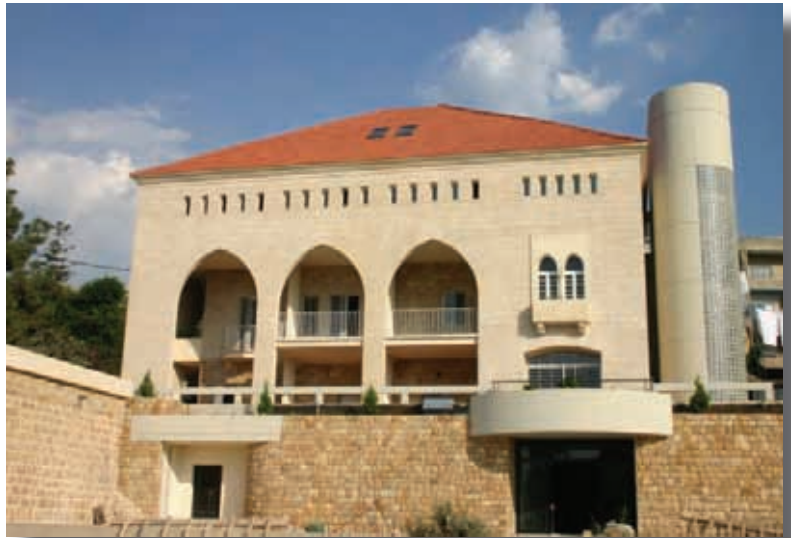
Our household is located on the upper balcony level of the People of God Community Center.